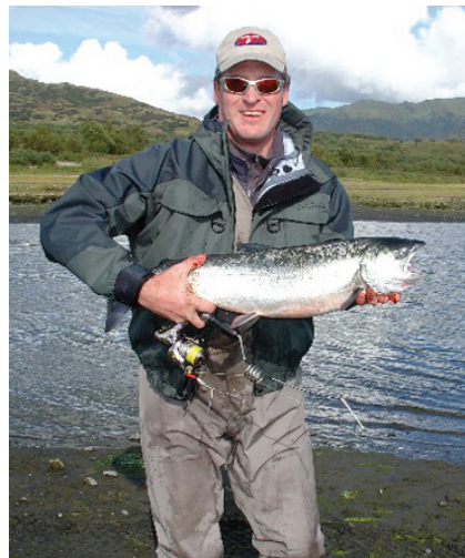
Coho Salmon Caught on a Mountaineer